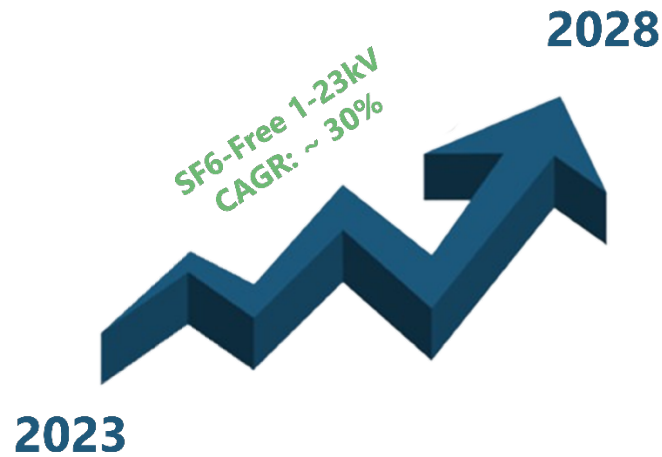
Figure 3: CAGR for SF 6 -free 1-24kV MV Transformer in Terms of Revenue from 2023-2028.