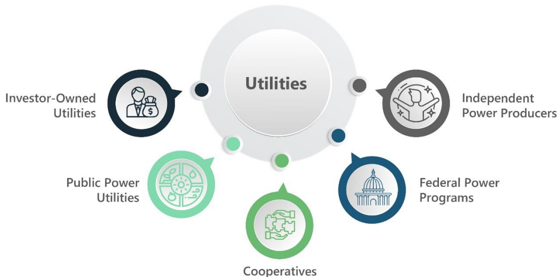
Figure 3: Types of utilities in the US.

IPPs are privately owned companies that own and operate generation assets to supply electricity to other utilities or end users. There are currently 11,000+ IPPs in the US.