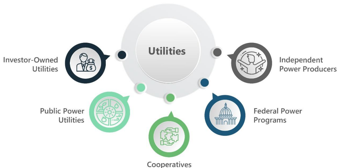
Figure 3: Types of utilities in the US.

IPPs are privately owned companies that own and operate generation assets to supply electricity to other utilities or end users. There are currently 11,000+ IPPs in the US.